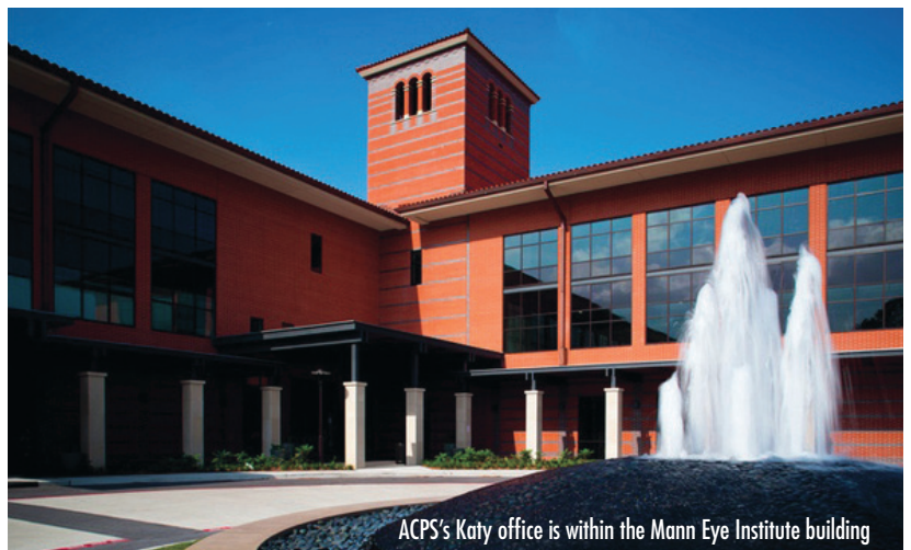
ACPS's Katy office is within the Mann Eye Institute building

12727 Kimberley Lane . Suite 300 Houston, Texas 77024 . 713.799.9999