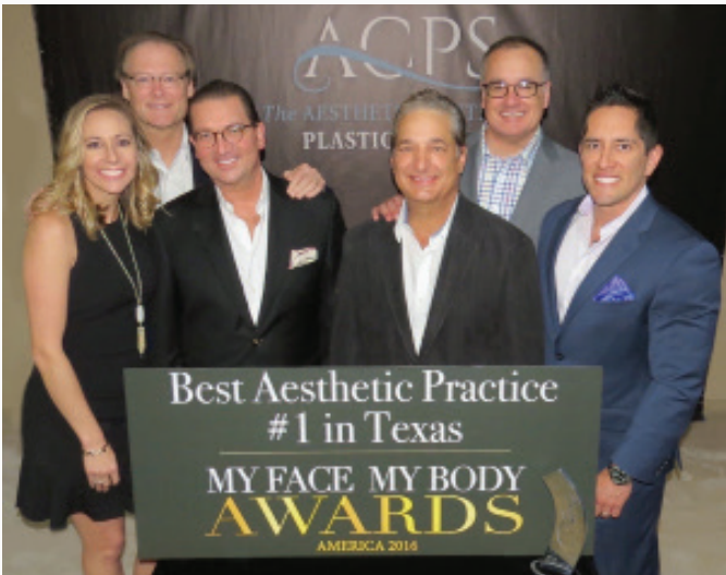
ACPS surgeons at the construction site of the ACPS Center for Excellence.

The spa will extend the same excellence in service to which you are accustomed in a sleek, contemporary setting. As soon as you step foot into the reception area, you will be welcomed into an upscale, modern Italian motif with silver and soft blue tones. The grand chandelier is centered over the first of several areas where you can peruse and sample not only your favorite products, but also leading