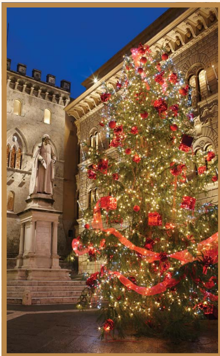
Christmas Tree in Piazza Salimbeni, Siena, Italy

We are interested in hearing your input about topics and questions you'd like us to address. You may submit your patient